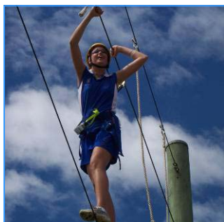
Academy athletes climb the high ropes at Borambola

Under the guidance of NSW Netball coaches and Academy coaches, participants will be exposed to new developments in the game as well as coaching of the highest calibre.